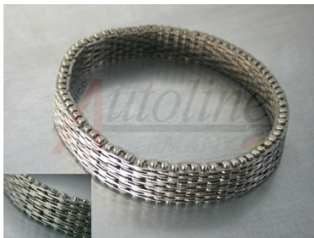
CVT Chain - G 03 27 KE033 01J0 - Original p/n 01J 331 301 BQ

part-no. on one chain link is 01J 331 301 BG - chain links are arranged in vertical straight rows - chain has more strings/layers (than the new design 01J 331 301 BQ) and therefore the height is approx. 38 mm - 75 chain link bolts - 25 links per layer - transmission codes: HHD - HHB - GWN - HSA - HHF - GYL - HEJ - HEK - HED - HDZ - HEB - HEF - JTT - JYA - JZU - JZT - KTS - JZQ - KTP - JZR - KTQ - KTN - JZP - KTK - HWK - KTJ - JZM - KTL - GYJ - KTT and probably others