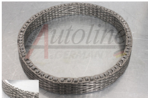
CVT Chain - G 03 27 KE033 0AW - Original p/n 0AW 331 301 B

part-no. on one chain link is 01J 331 301 BQ - chain links are arranged admixed/offset starting and ending 1-1 layers than 2-1-2-1 and so on - chain has less strings and therefore the height is less ( height: approx. 34 mm ) in comparison with the first design of 01J-chains (01J 331 301 BG) - 75 link bolts (normal distance between bolts: 3,6 mm - but 19 gaps are 6,3 mm - due to that this chain is slightly shorter than the one for 0AW - ITS IS VERY DIFFICULT TO DIFFERENTIATE THESE TWO CHAINS - best is to check the part no. on the chain) - transmission codes: HSB - JZK - KTG - HJB and probably others