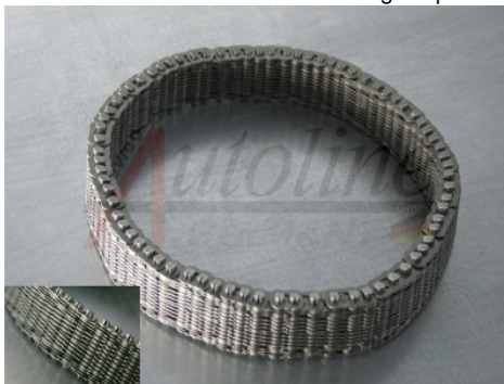
CVT Chain - G 03 27 KE033 0101 - Original p/n 01J 331 301 BG